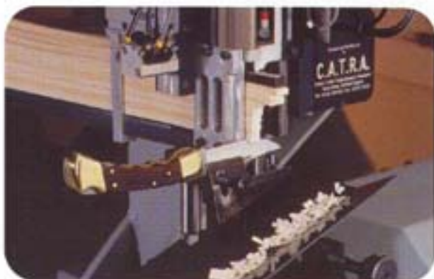
To ensure the best materials and edge preparation, Buck uses a computerized CATRA machine to test edge sharpness and retention.