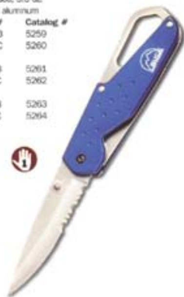
The Approach Model # 751