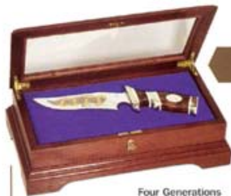
Four Generations Sub-Hilt Bowie knife.