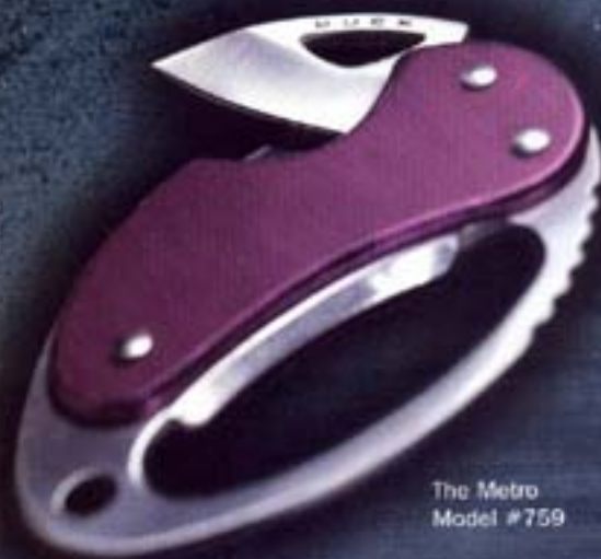
The Metro Model #759

You never know when a good knife might come in handy. Regardless of whether you keep it in your pocket, purse or glove compartment, our everyday knives can get you out of a bind. Conquer boxes. Vanquish dangling threads. Subdue stubborn envelopes. Never be unprepared again.