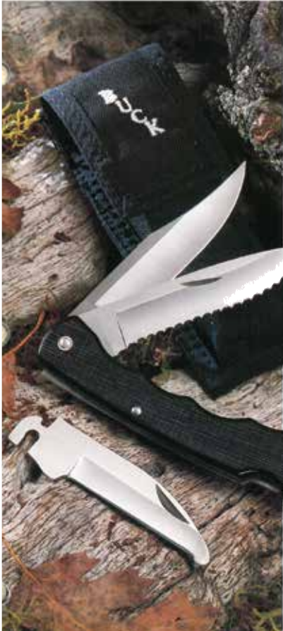
1990 Buck Catalog

Changing out the blades is a simple procedure. One merely has to depress the lockbar and slide the blade into (or out of, if removing it from) the pivot rivet. Once the blade is in place, it can be rotated to either an all open or closed position and you will immediately be able to tell if it is in proper alignment. It is not difficult and does not require a great amount of strength. A cautionary warning is probably not needed for this group of readers. However, I will go ahead and suggest that you take care as you install or remove the blade. You are, after all, handling a sharp object.