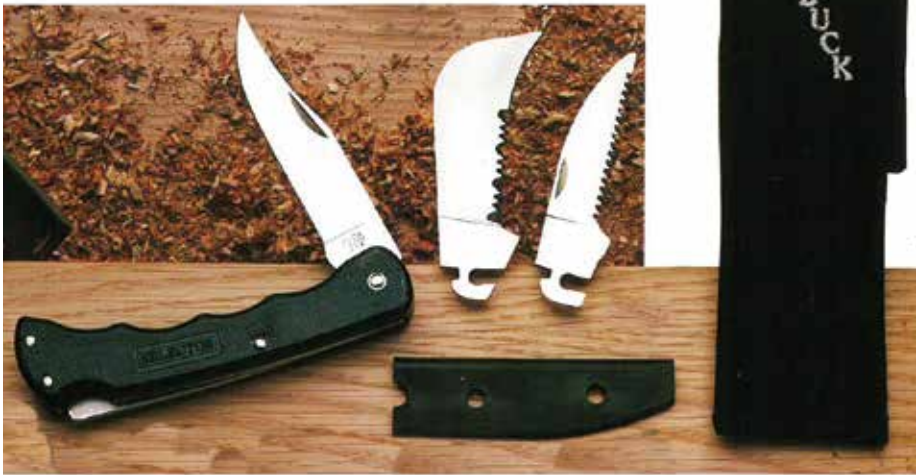
1992 Work-Man Catalog

The early 428 and 429 models included a black nylon sheath fitted with a separate pocket to store an extra blade or two. (Note that the 429OD olive drab model came with a green camouflage nylon sheath.) Later Selectors were paired with the heavier Cordura nylon type sheath in either black or camouflage. In addition, the Selector blades were accompanied by a black plastic holder/protector that could be used to protect the hand while switching out the blades and also served as a storage sheath. Often, these blade