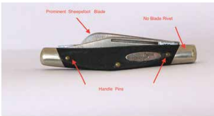
Photo 1. Schrade Contract 303

Photo 1 and Photo 2 show two knives that illustrate most of the characteristics needed for dating purposes. Photo 1 is a Schrade 301 with handle pins and no visible blade rivets in the bolsters. In addition, the sheepfoot blade, which is larger than on the Camillus, is pretty visible or prominent in the closed position. Photo 2 is a Camillus 301 with no handle pins and with visible blade rivets in the bolsters. If a knife has been heavily buffed or polished, the blade rivets might be difficult to see, but careful examination will show them. The sheepfoot blade on Camillus knives is not very visible in the closed position. Both the Schrade and Camillus knives have the typical Knife, Bolt and Hammer escutcheon