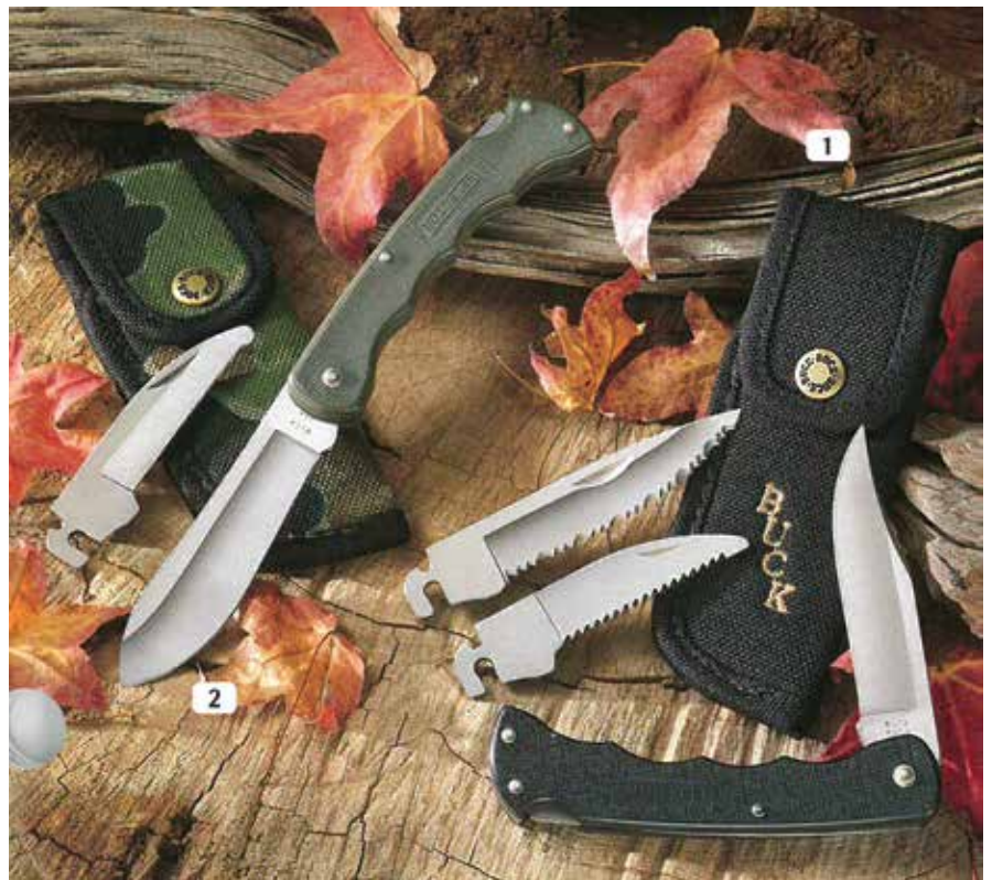
1994 Buck Catalog

It is not extremely difficult to assemble a complete collection of each of the above knives in each of the colors: black, olive drab and orange. You may find it a bit more difficult to locate new-in-box versions, especially for the Tool Box Selector. You also may find some of the ten blades to be a challenge to locate, but it can be done and they do show up on the auction sites, at knife shows and on consignment lists. A real challenge is to find ten separate blades for each color of handle plus the Workman version. Good luck and pick your blades with care.