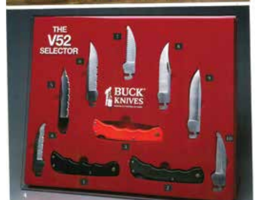
1991 Buck Catalog